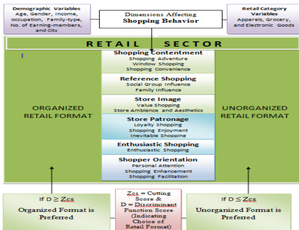
Figure 2: Shopping Behavior Model for Retail Format Choice

Shopping Behavior Model For Retail Format Choice : On the basis of above results the following model is proposed for choice of retail formats.